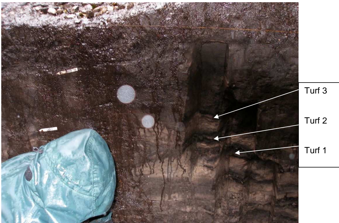
Figure 2: Detail of monolith sample in south face of Trench 4 showing stacked turfs sampled for pollen analysis. Depths for the topsoil of the three turfs: Turf 3 (0.53m); Turf 2 (0.61m); Turf 1 (0.72m).