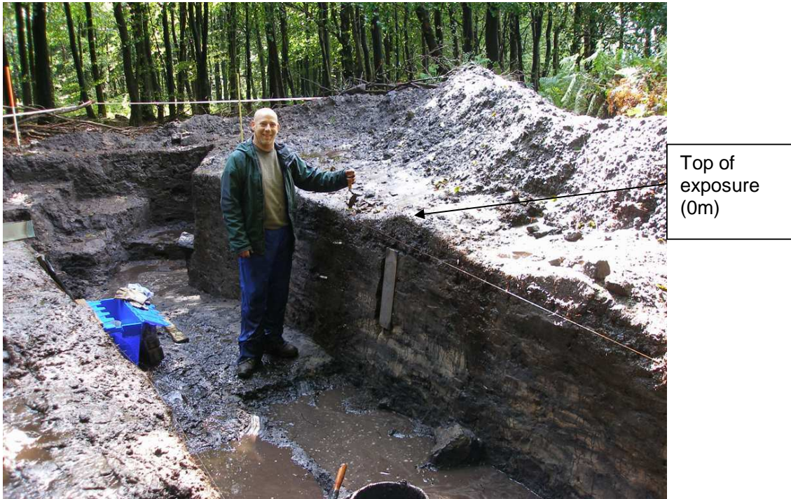
Figure 1: Trench 4 excavated in September 2008 showing location of monolith sample (0.22-0.72m) in south face. Distance from top of monolith to top of exposure is 0.22m, comprising disturbed soil.