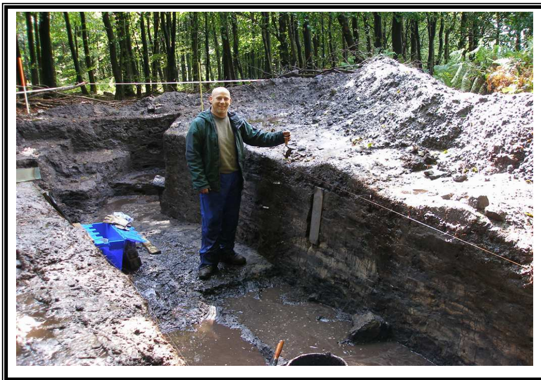
Southern face of Trench 4, Beacon Hill barrow: position of upper monolith tin used to collect sediments for pollen analysis. September 2008.

Analyst: Dr Wendy Woodland, University of the West of England, Bristol